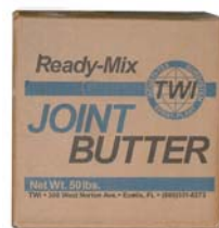
50 lb. Carton