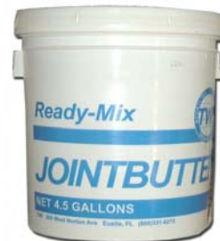
62 lb. Pail